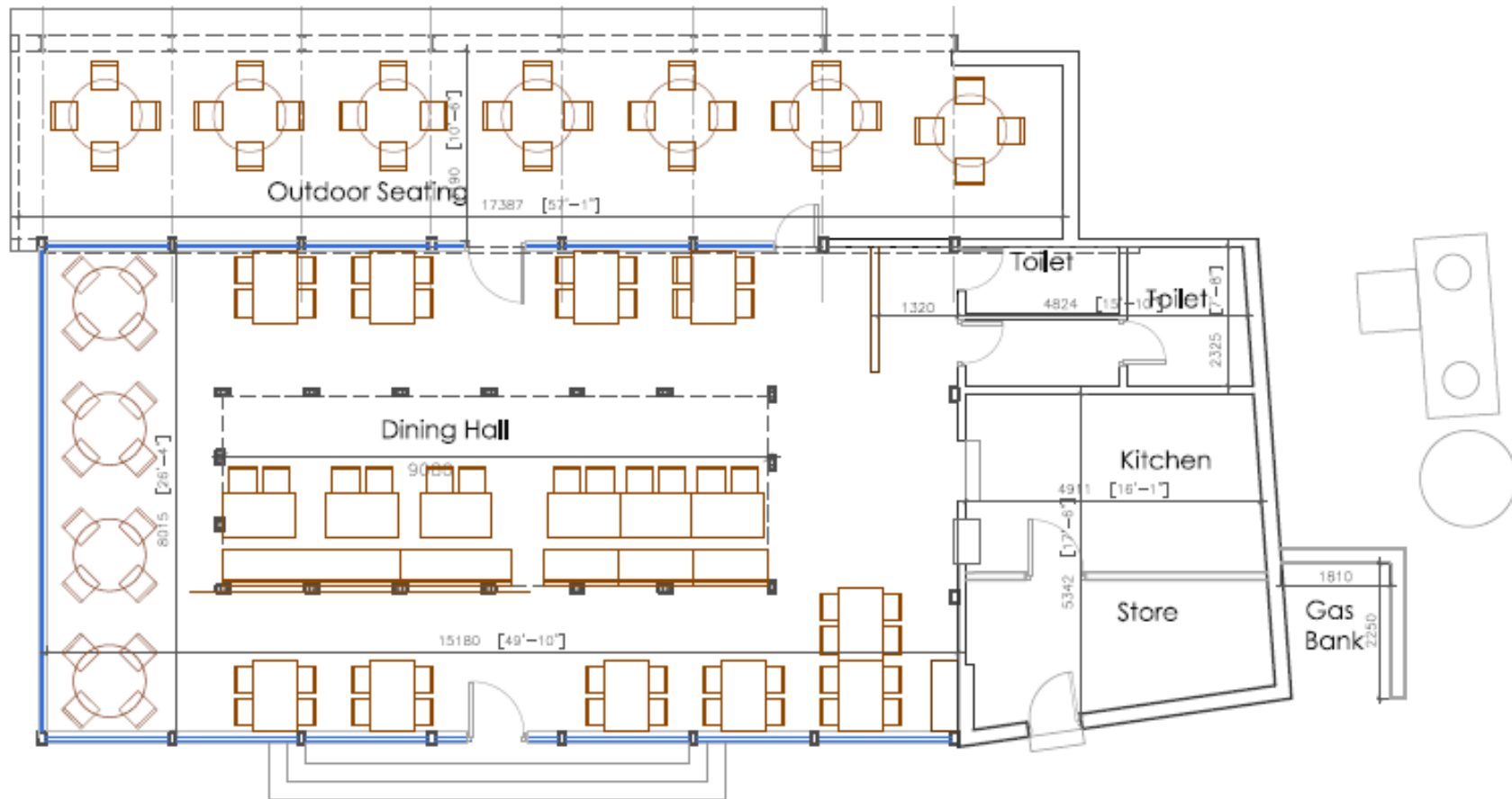
Proposed Layout for Furniture